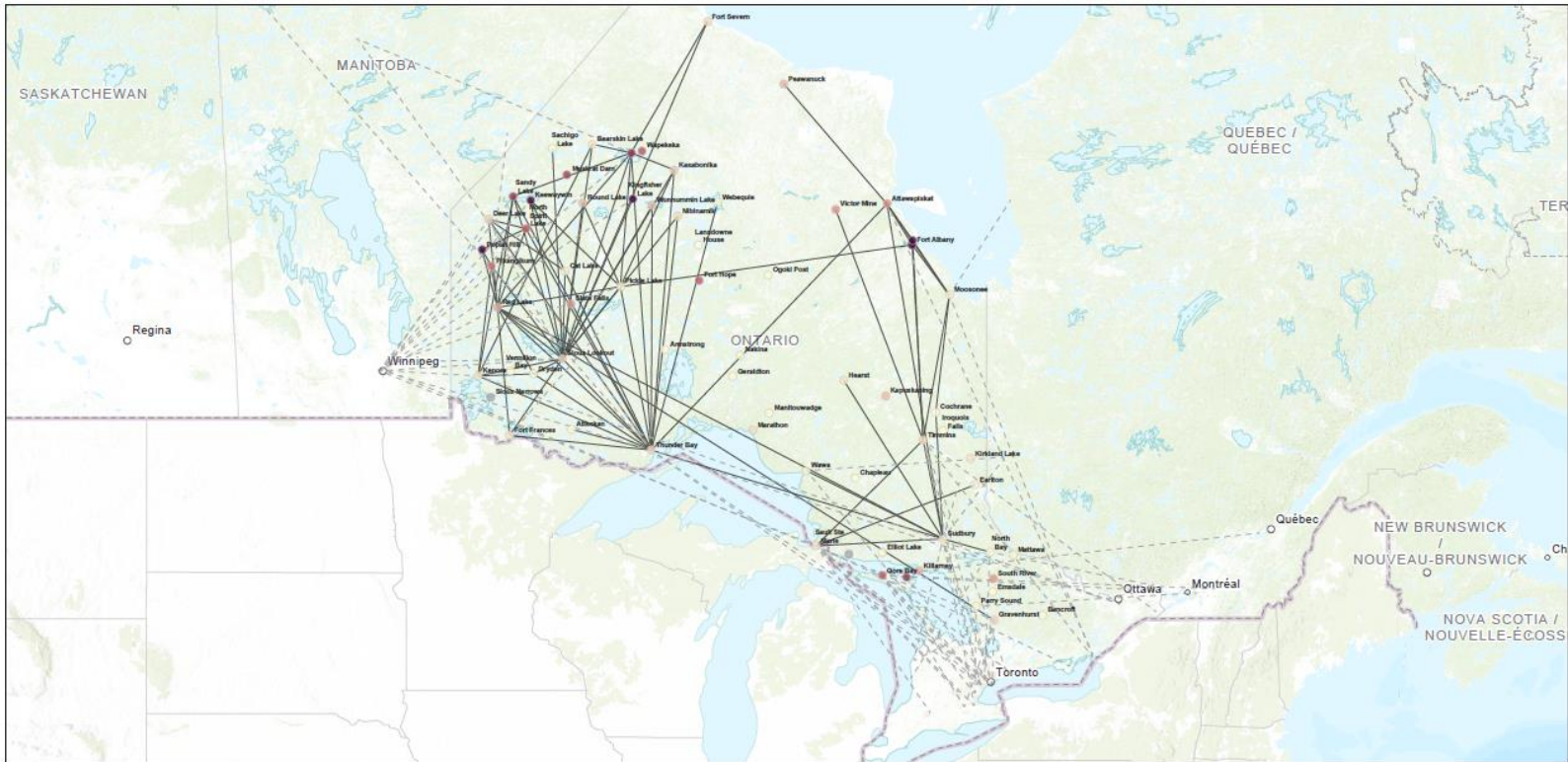
Northern Ontario Airports - Percent Change in Number of Flights, 2021 to 2023