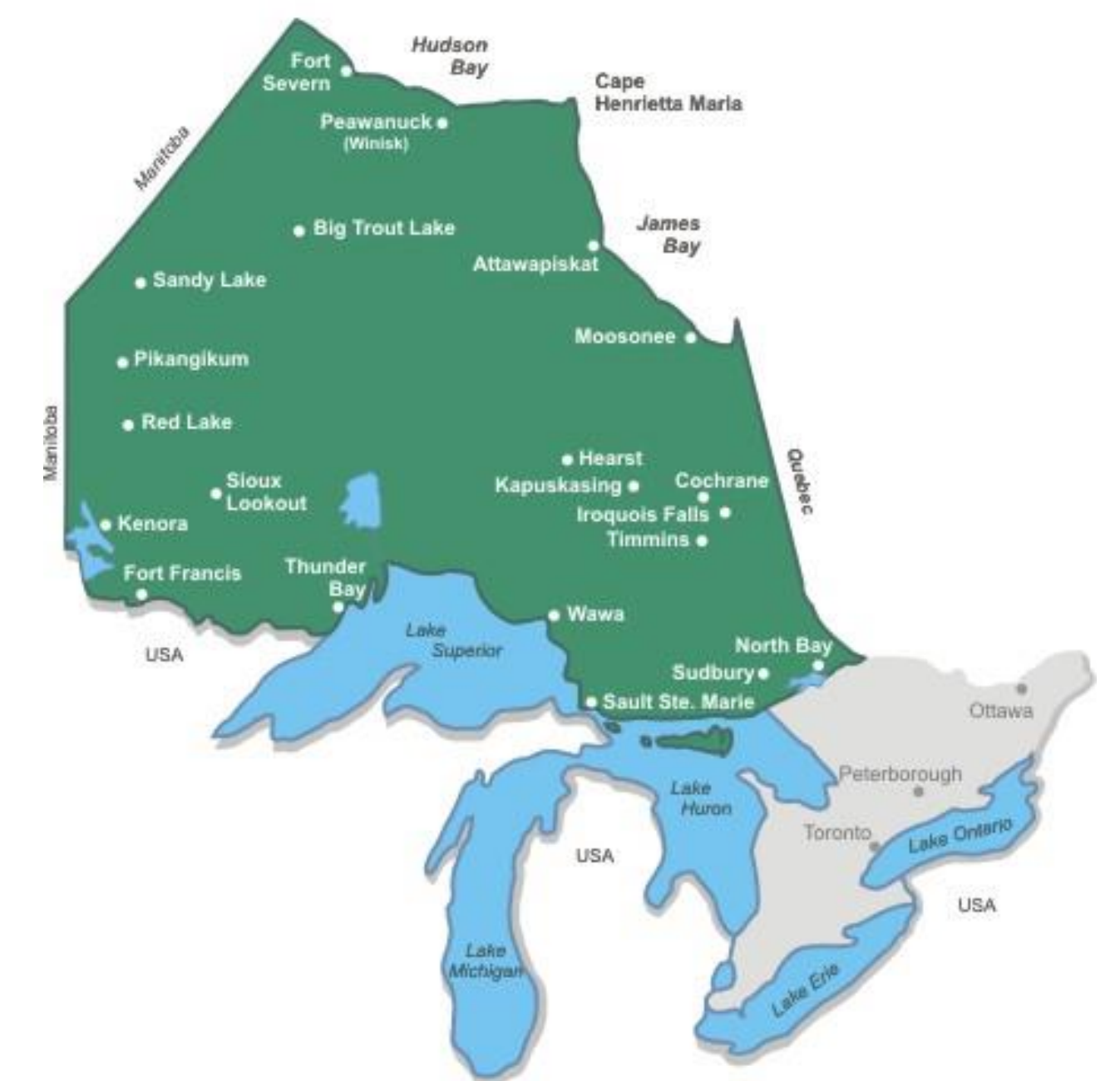
Geography of Northern Ontario 1